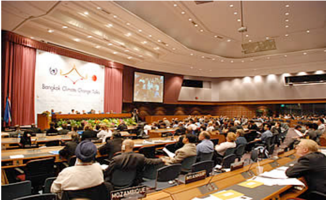
Ad Hoc Working Group on Long-term Cooperative Action under the Convention (AWGLCA), Closing Plenary in Bangkok, April 2008.